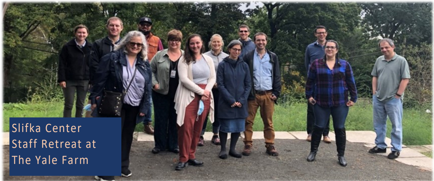
Slifka Center Staff Retreat at The Yale Farm