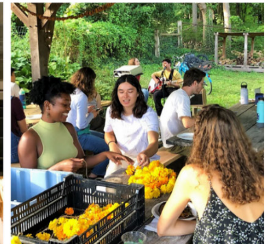
L to R: Yom Kippur Food Drive First Student arrives at Slifka North! Lots of Lox at Bagel Brunch Sukkot garlands at The Yale Farm